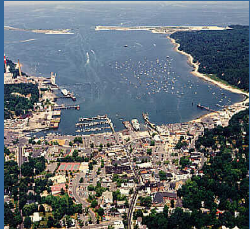
Port Jefferson, NY; Google images.